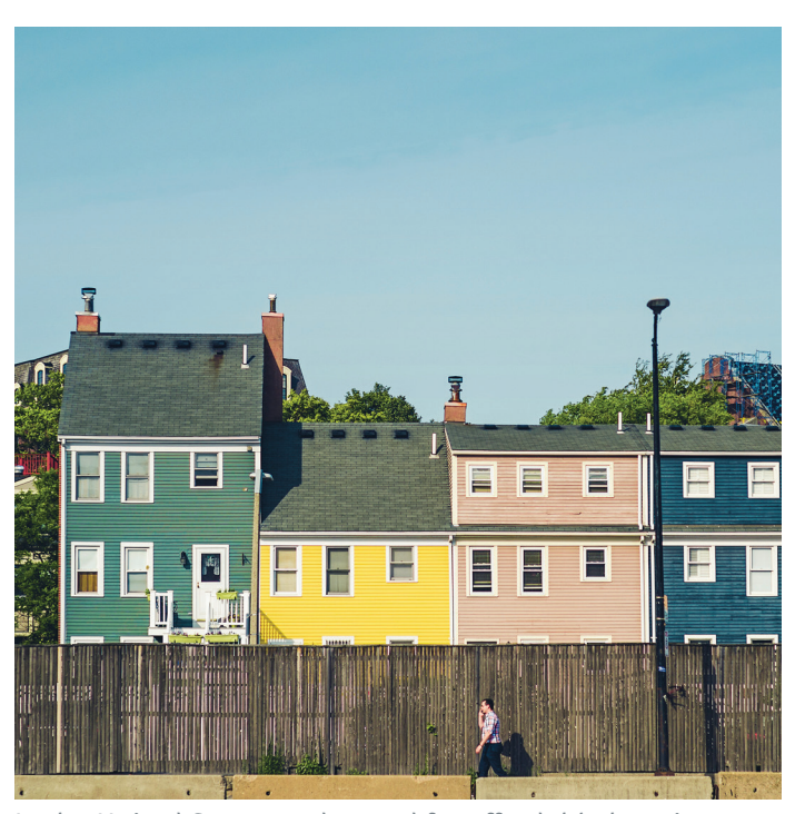
In the United States, a demand for affordable housing continues to outpace supply.

continues to outpace supply.<sup>3</sup> It is plausible that more tax credits would lead to more units, but the "big" empirical policy question is whether a system of tax credits is the most efficient way to build the affordable housing we need.* That question is extremely difficult, if not impossible to answer. The decentralized, public-private approach to affordable housing finance, of which LIHTC is the fulcrum, emerged from a more traditional government production model that was itself not meeting the need, and was vigorously attacked by proponents of a more conservative, free-market approach.<sup>4</sup>