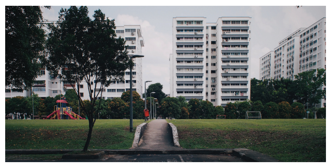
Income support, subsidies, and other measures address the economic resources of low-income people.

A large proportion of households report refusal to rent by landlords based on their use of a voucher. A pilot study found that across five sites surveyed, rates of voucher denials by landlords ranged from 15 percent (Washington, DC) to 78 percent (Fort Worth, TX), with 59 percent of the total tests conducted resulting in voucher denials by landlords.<sup>229</sup> Only 11 states and D.C. have laws that prohibit discrimination based on source of income (SOI) including receipt of a housing voucher.<sup>230</sup> SOI protections have been found to increase voucher utilization,<sup>231</sup> and may be associated with more voucher holders moving to lower poverty areas.<sup>232</sup> Important research gaps include the impacts