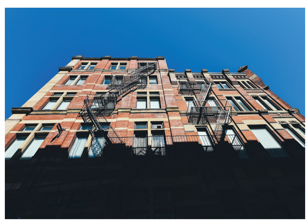
There is general agreement that federal rental assistance programs can and do work to protect families from homelessness, and make housing affordable for many low-income individuals and families.

When housing costs exceed 30 percent of a family's income, rent and wages are both in play. Addressing regulatory factors that inflate the cost of housing is only one way to use legal levers for housing equity. It is also important to explore putting more resources in the hands of lower-income people making housing choices, giving them more agency in deciding where to live. The question of money has special resonance in the matter of housing for people of color. As historian