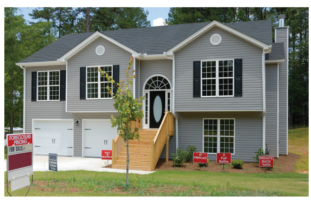
Foreclosure impacts vulnerable populations, and can negatively impact communities by decreasing property values, increasing crime, and causing fiscal stress on local governments and services.

We found one report analyzing a program that does not fit into the categories identified above. Pursuant to a Michigan law requiring municipalities to make available a property tax exemption for residents living in poverty, 136 Detroit established the Homeowners Property Tax Assistance Program (HPTAP). The program allows either full (100 percent) or partial (50 percent) property tax relief for homeowners living close to or below the federal poverty line.<sup>137</sup> The report we found analyzing HPTAP indicated that many Detroit homeowners did not take advantage of the program because they were either unaware of its existence or faced barriers in the application process that prevented them from participating. 138 Some of the barriers included having to fill out a form to request an application, receiving an application with a due date that has already passed, and having to submit